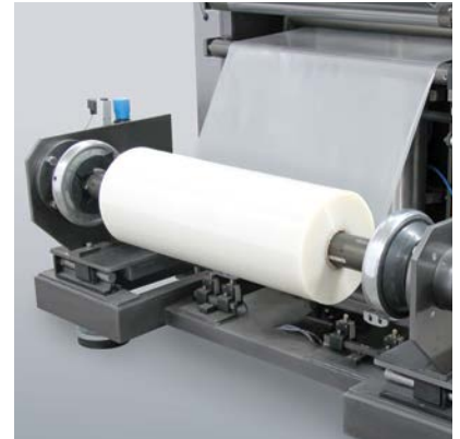
Roll unwinding assembly